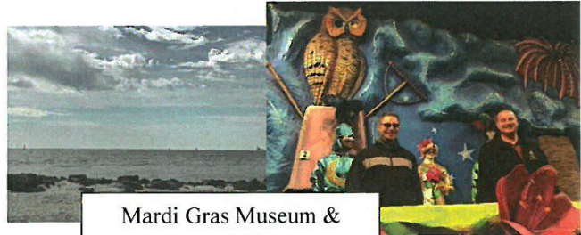
Mardi Gras Museum & Gulf of Mexico